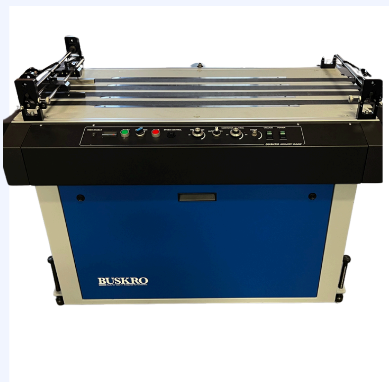
BK71B Transport Base